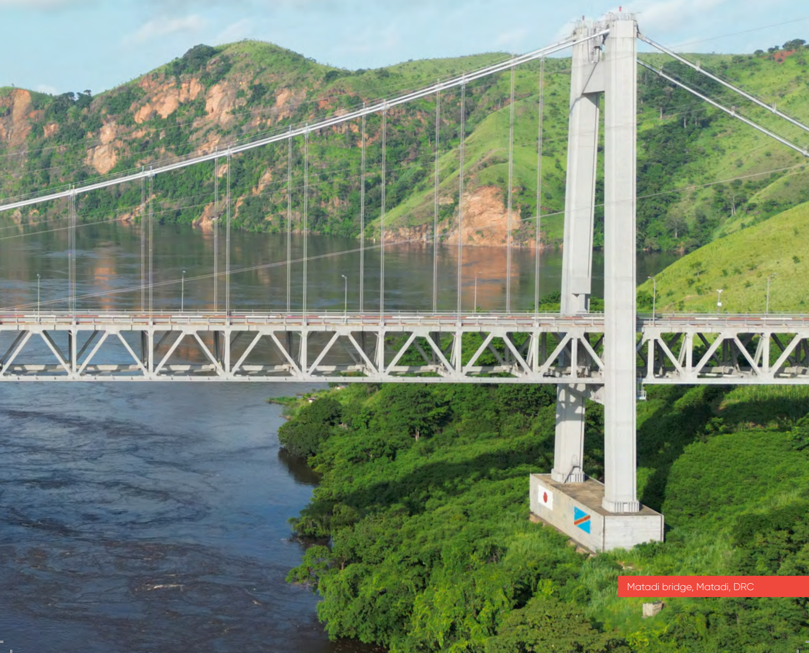
Matadi bridge, Matadi, DRC