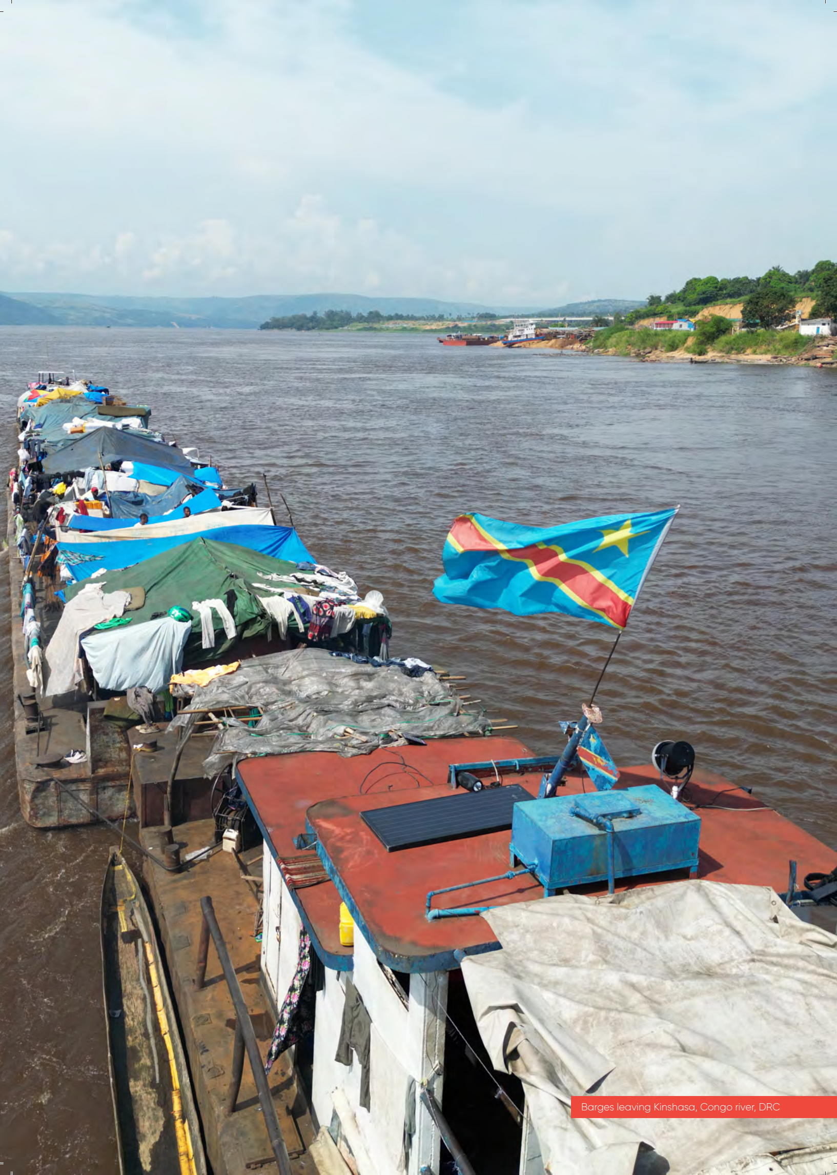
Barges leaving Kinshasa, Congo river, DRC