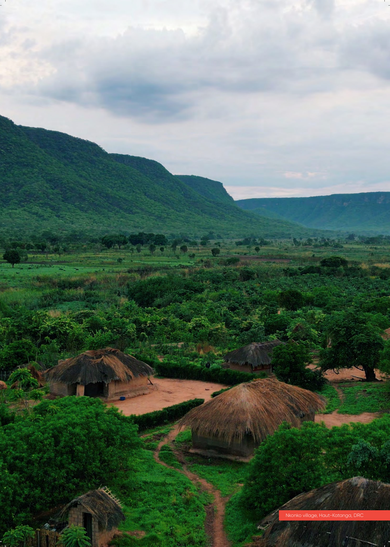
Nkonko village, Haut-Katanga, DRC